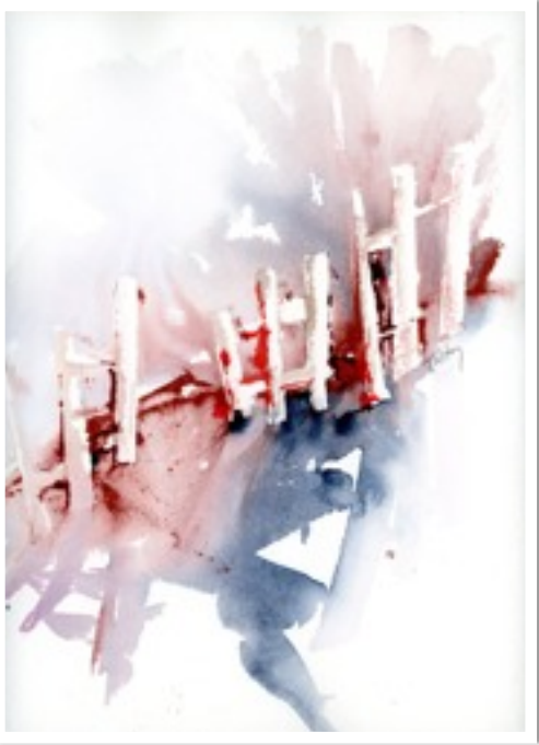
“Fence With Red”