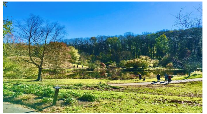
Scenes from the Nov. 4 Paint Out at Meadowlark Gardens with students of Jane Counce. Beautiful day to be out.