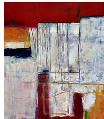
Sound of Line 25