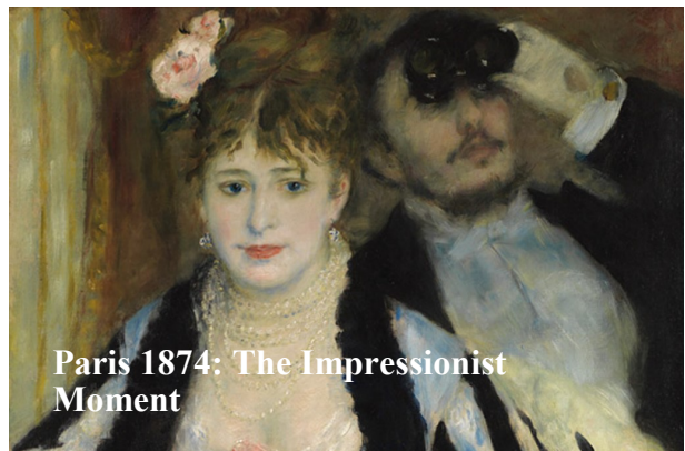
Paris 1874: The Impressionist Moment

Discover the origins of the French art movement at a new NGA show that presents 130 works, including a rare reunion of many of the paintings first featured in that now-legendary radical 1874 exhibition considered the birth of modern painting.